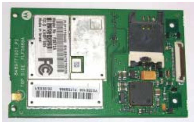
Photograph 9-1: Front side of module main board.