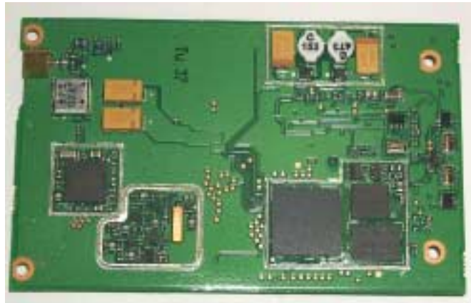
Photograph 9-4: Back side of module main board with shields removed.