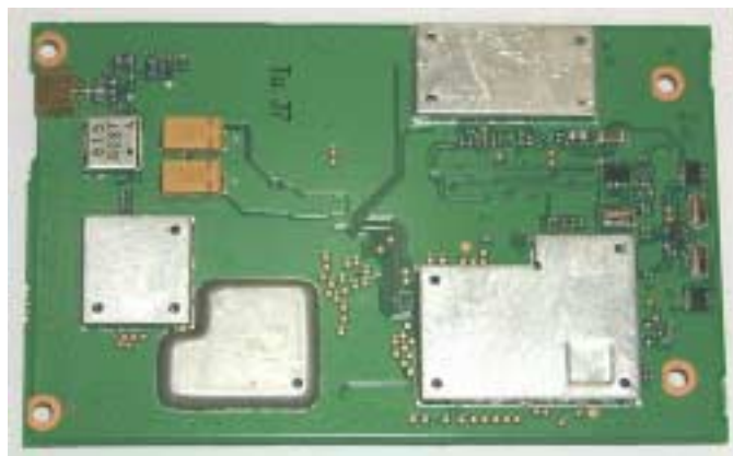
Photograph 9-3: Back side of module main board.