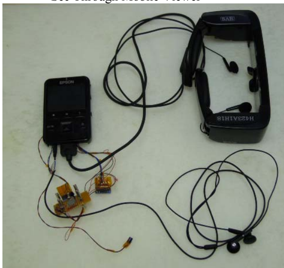
Head Mount Display

<Host device and accessories> See Through Mobile Viewer