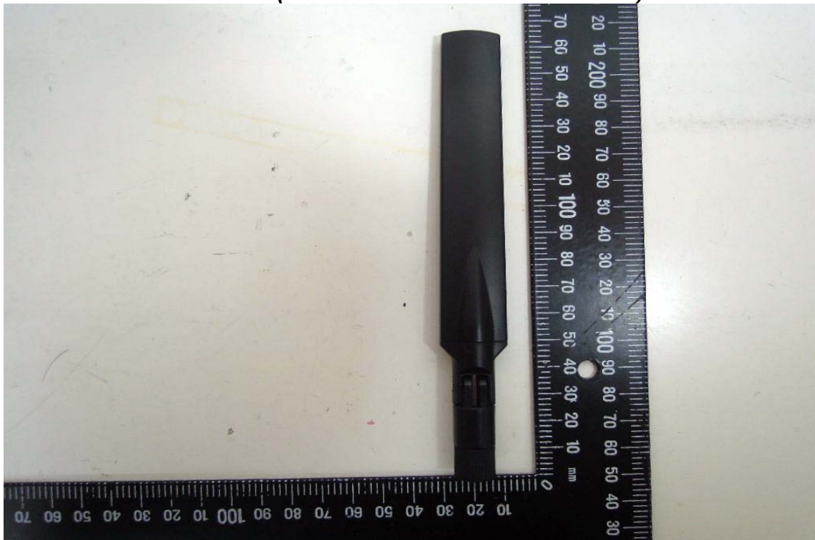
Antenna (Model No.: T17-058-1070)