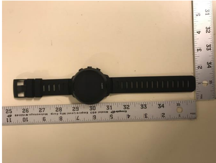
Figure B1: Top view DUT