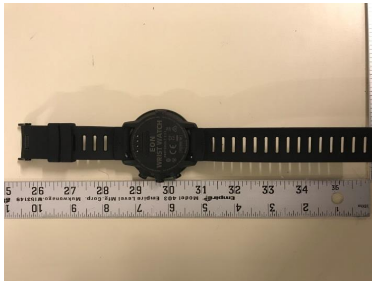
Figure B2: Rear view DUT