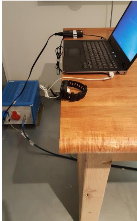
Figure B3 Conducted Emission test set up