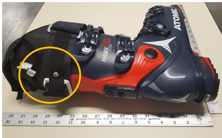
Figure B3. DUTs in Ski boot