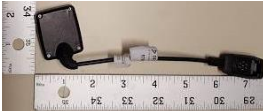
Figure B2. DUT rear view