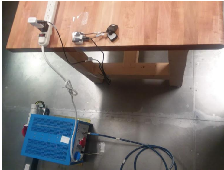
Figure B4 Conducted Emission test set up