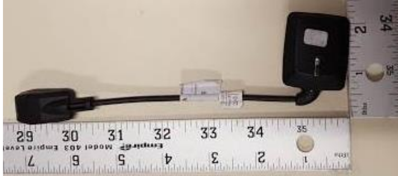
Figure B1. Top View of DUT