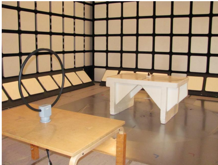
Photograph 2. Spurious emissions 9kHz - 30 MHz