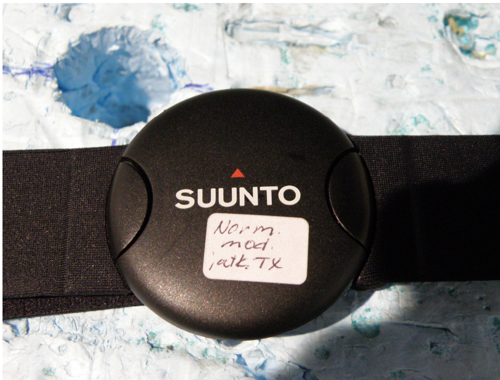
Photograph 4 Equipment under Test