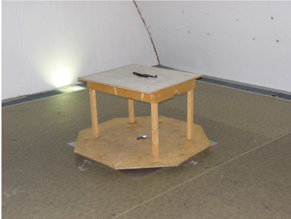
Photograph 3 Radiated emissions test setup (FCC Reg. No. 90569).