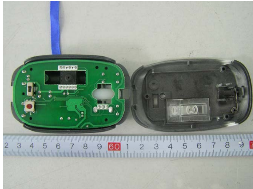
EUT-Cover off View (2)