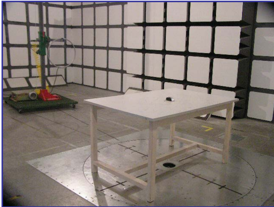
Radiated Emissions - Rear View for Fundamental