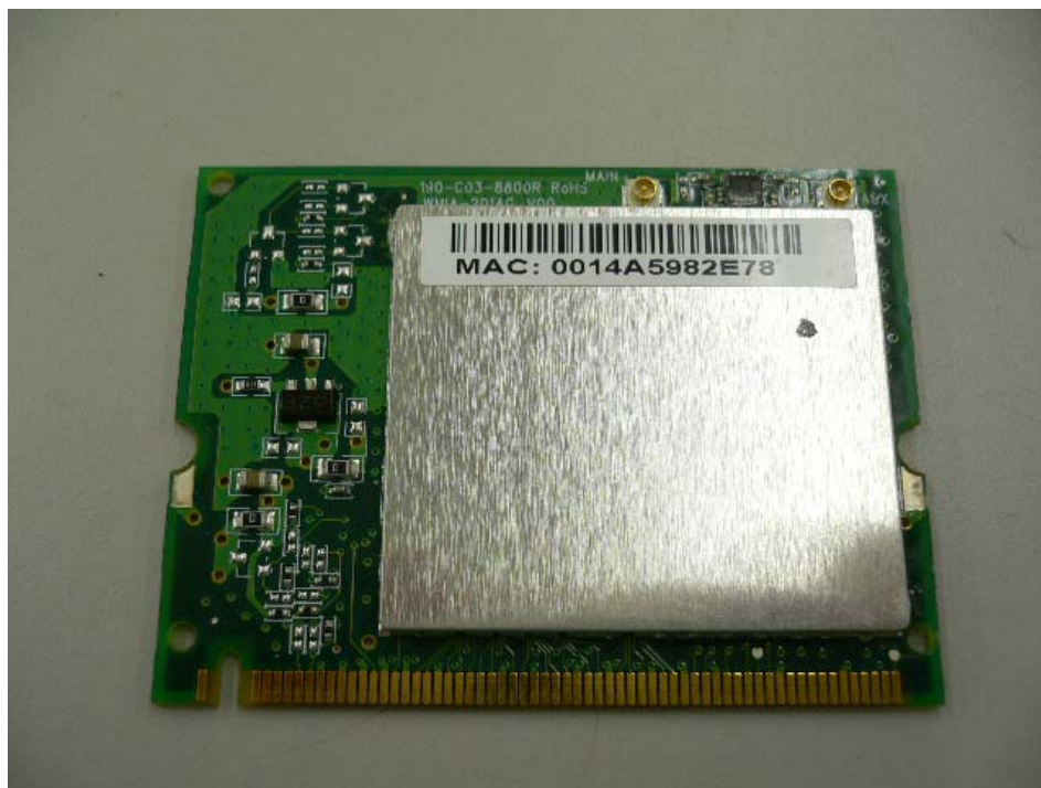
RF Module Top (with cover)