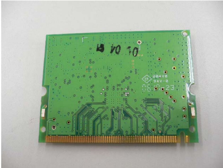
RF Module Bottom

Omron Corporation Okayama factory FCC ID: RXEWE70CL