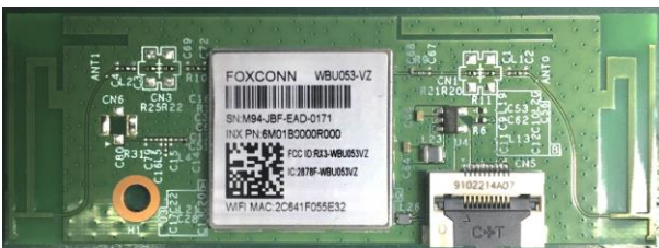
Figure 3 Top Side Photo