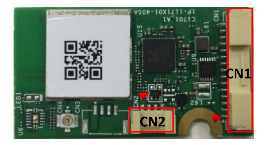
Figure 1 Pin Definitions (Module Top View)