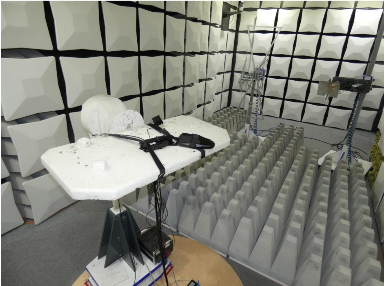
Photo 3: Test setup for radiated measurements (Enclosure, fully-anechoic chamber)