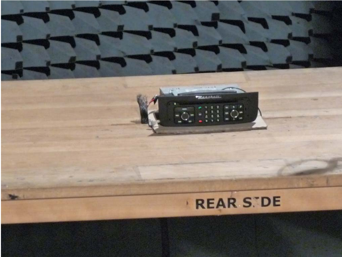
Photo 1: Test setup for radiated measurements (Enclosure, below 30 MHz)