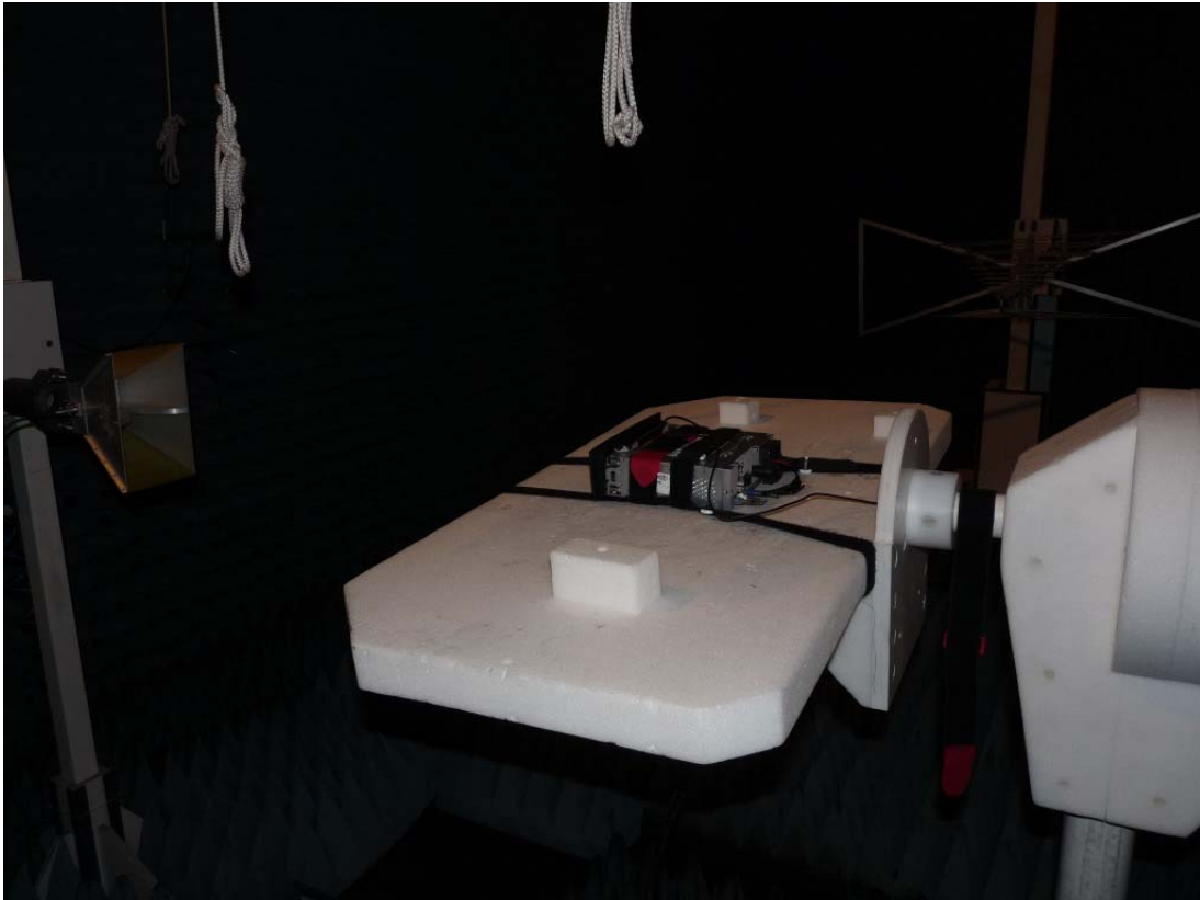
Photo 3: Test setup for radiated measurements (Enclosure, above 1 GHz)