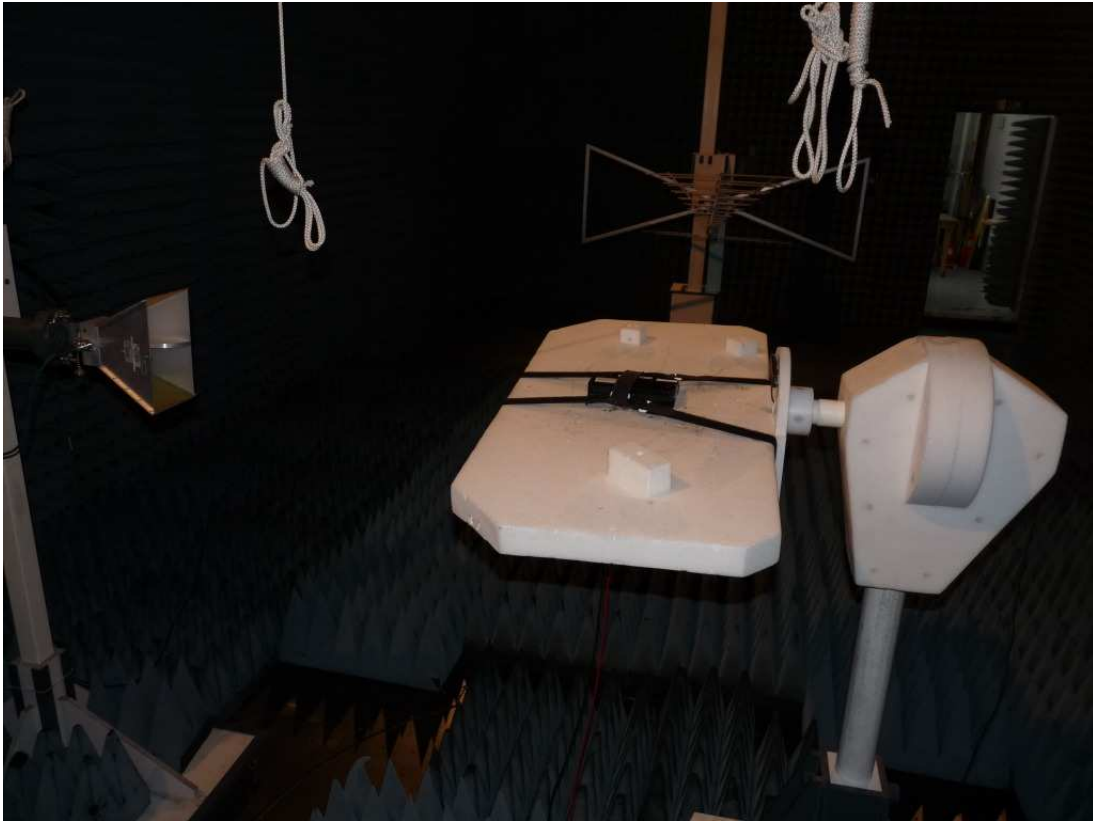
Photo 3: Test setup for radiated measurements (Enclosure, above 1 GHz)