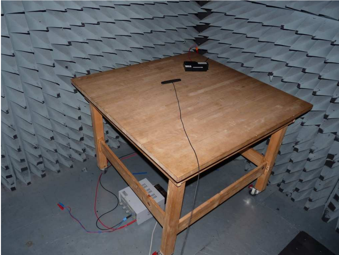
Photo 1: Test setup for radiated measurements (Enclosure, below 30 MHz)