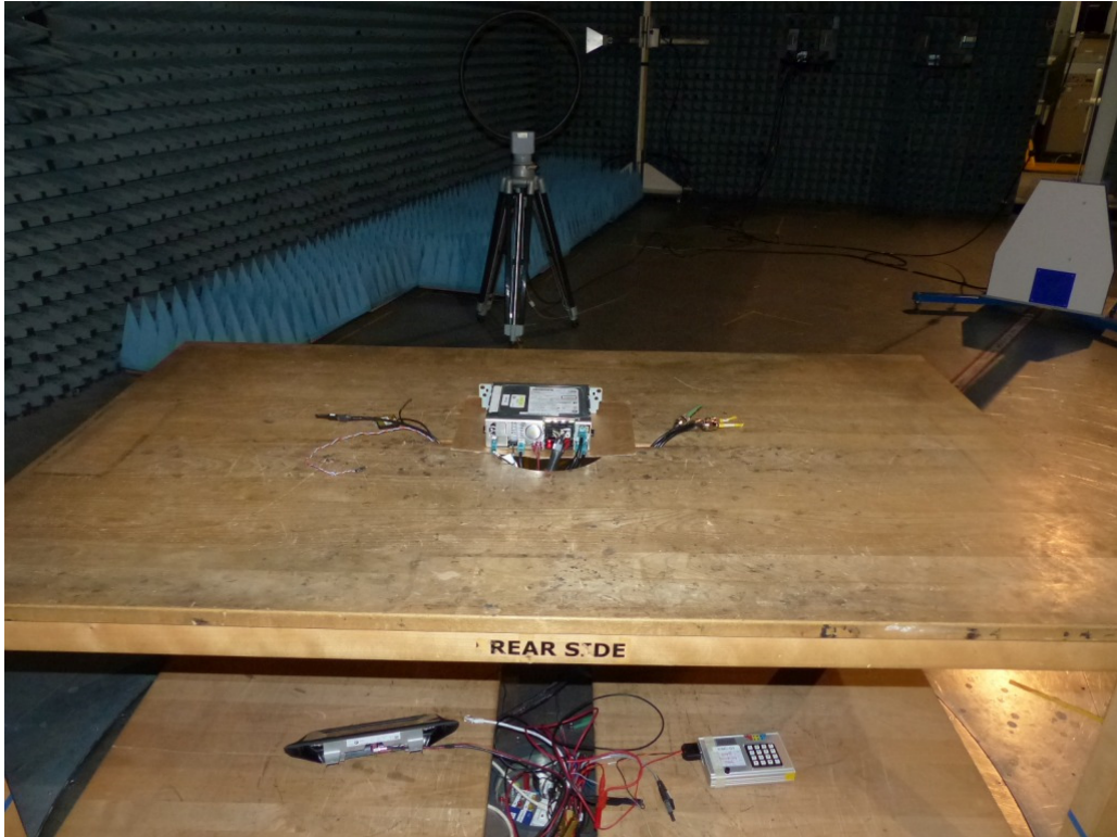
Photo 1: Test setup for radiated measurements (Enclosure, below 30 MHz, intentional radiator §15)