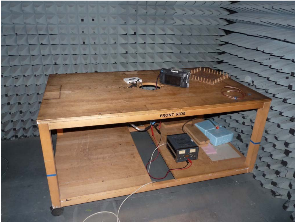
Photo 1: Test setup for radiated measurements (Enclosure, below 30 MHz, intentional radiator §15)