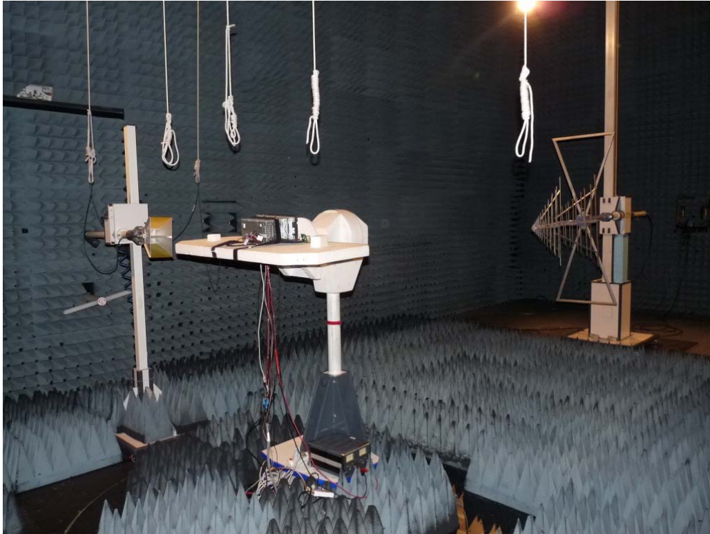
Photo 3: Test setup for radiated measurements (Enclosure, fully-anechoic chamber, 1-18 GHz intentional radiator §15 / 30 MHz – 10/20 GHz)