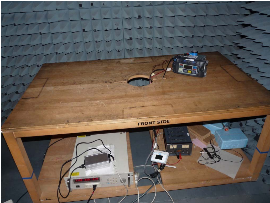
Photo 1: Test setup for radiated measurements (Enclosure, below 30 MHz, intentional radiator §15)