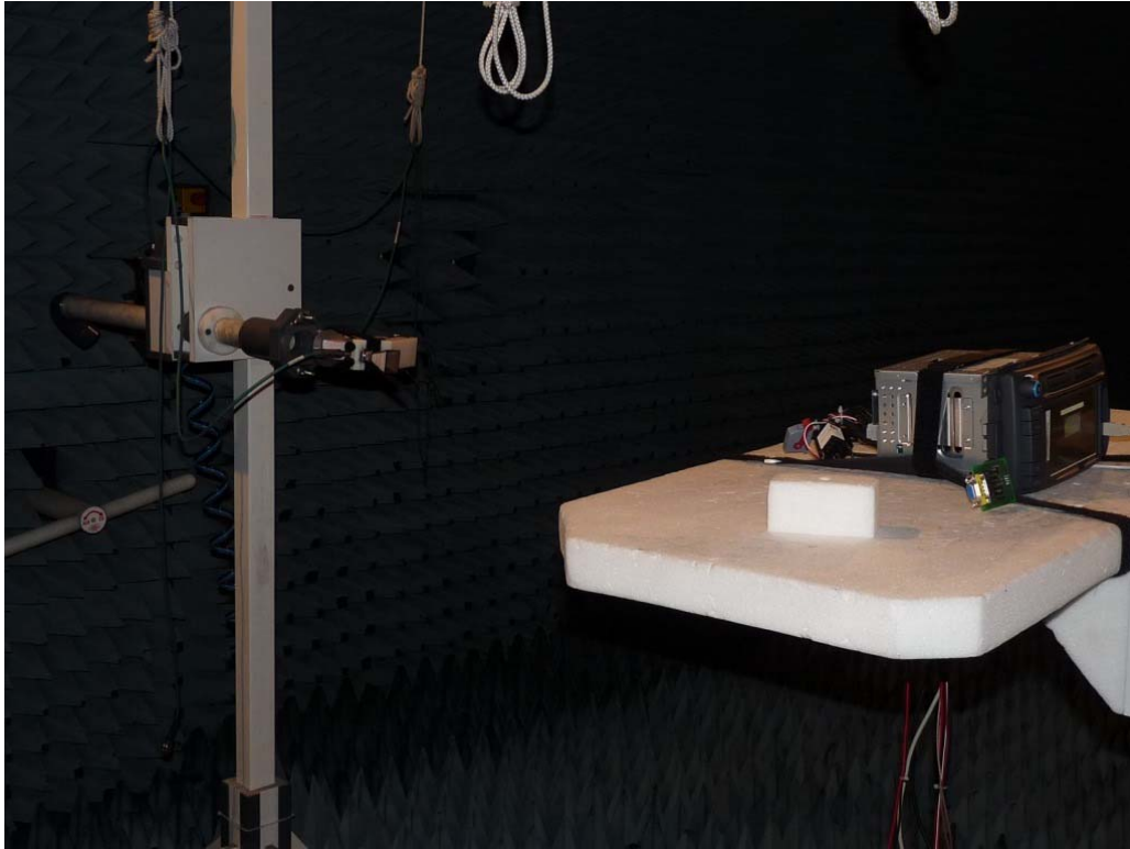
Photo 4: Test setup for radiated measurements (Enclosure, fully-anechoic chamber, 18-25 GHz, intentional radiator § 15)