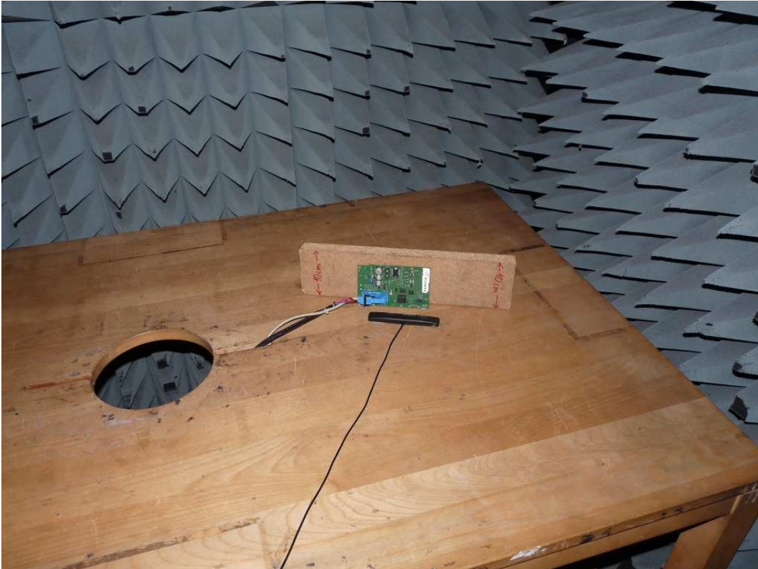
Photo 1: Test setup for radiated measurements (Enclosure, below 30 MHz)