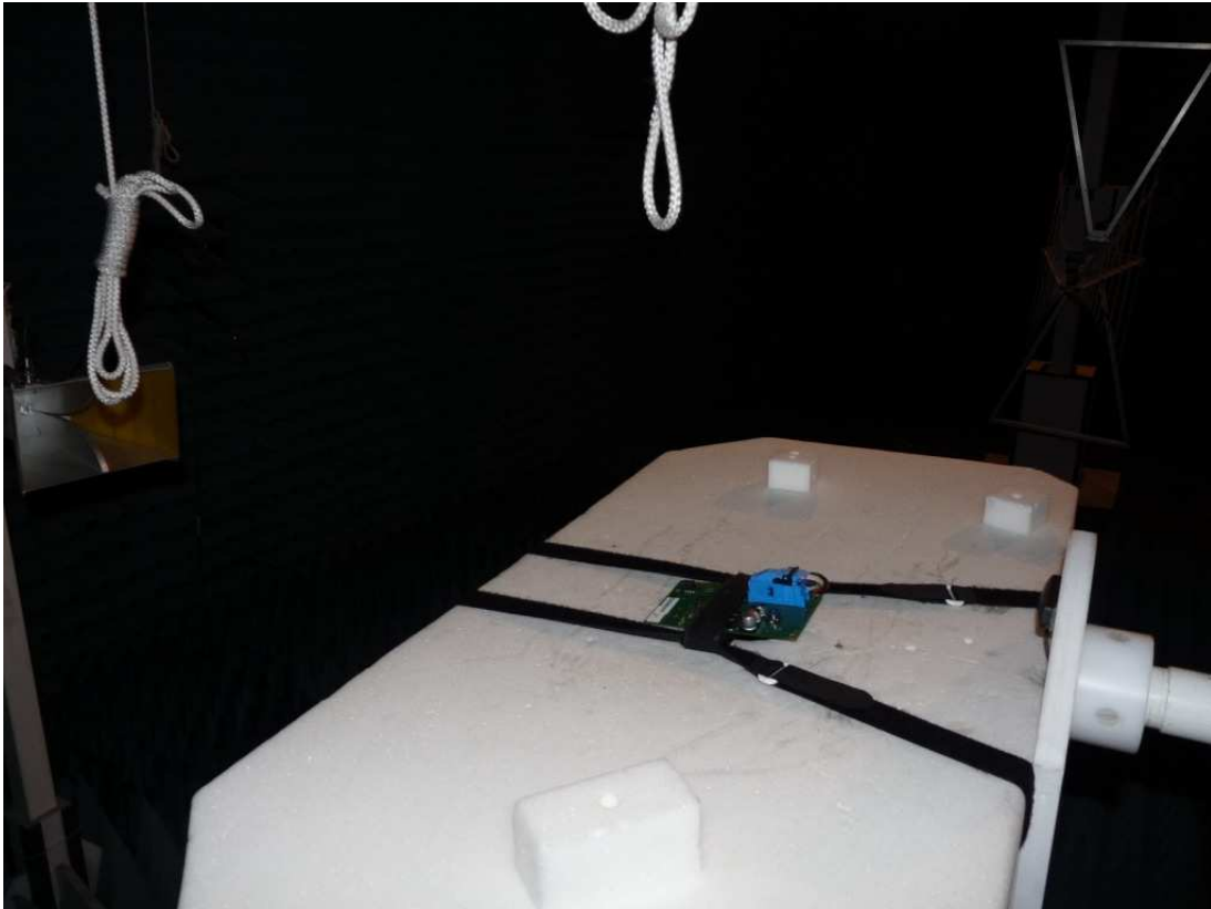
Photo 3: Test setup for radiated measurements (Enclosure, above 1 GHz)