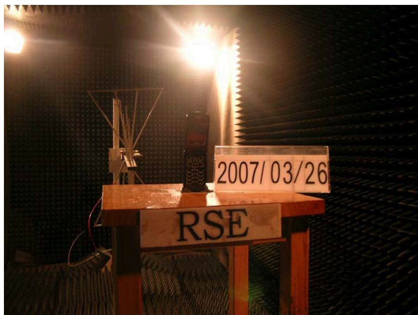
Pic2 Radiated Spurious Emission