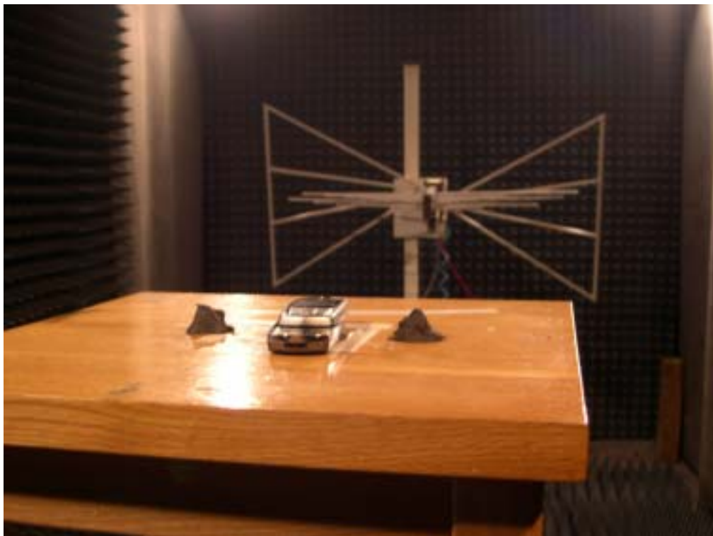
Pic2 Radiated Spurious Emission