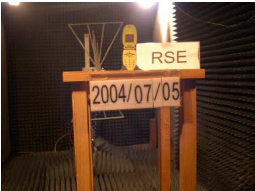
Pic2 Radiated Spurious Emission