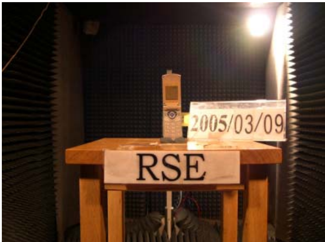
Pic2 Radiated Spurious Emission