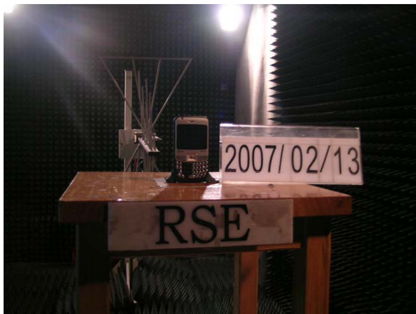
Pic2 Radiated Spurious Emission