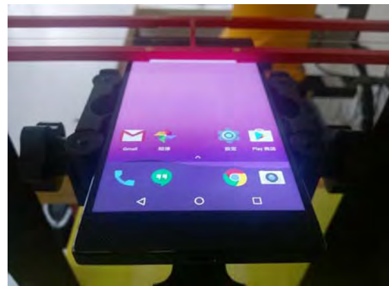
Fig. 2 Receiver of mobile contact center of Arch

Unless otherwise stated the results shown in this test report refer only to the sample(s) tested and such sample(s) are retained for 90 days only. 除非另有說明，此報告結果僅對測試之樣品負責，同時此樣品僅保留90天。本報告未經本公司書面許可，不可部份複製。