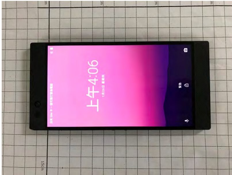
Fig. 3 Front view of EUT