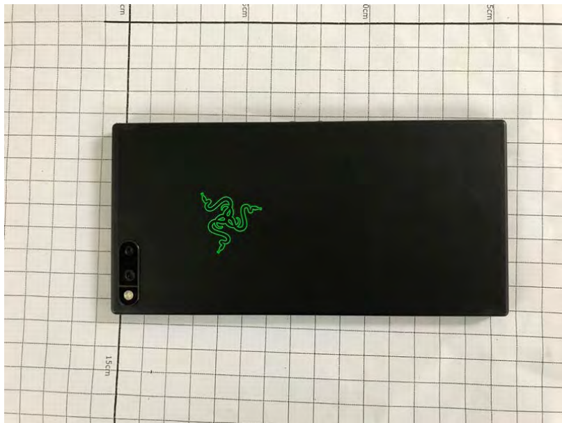
Fig. 4 Back view of EUT