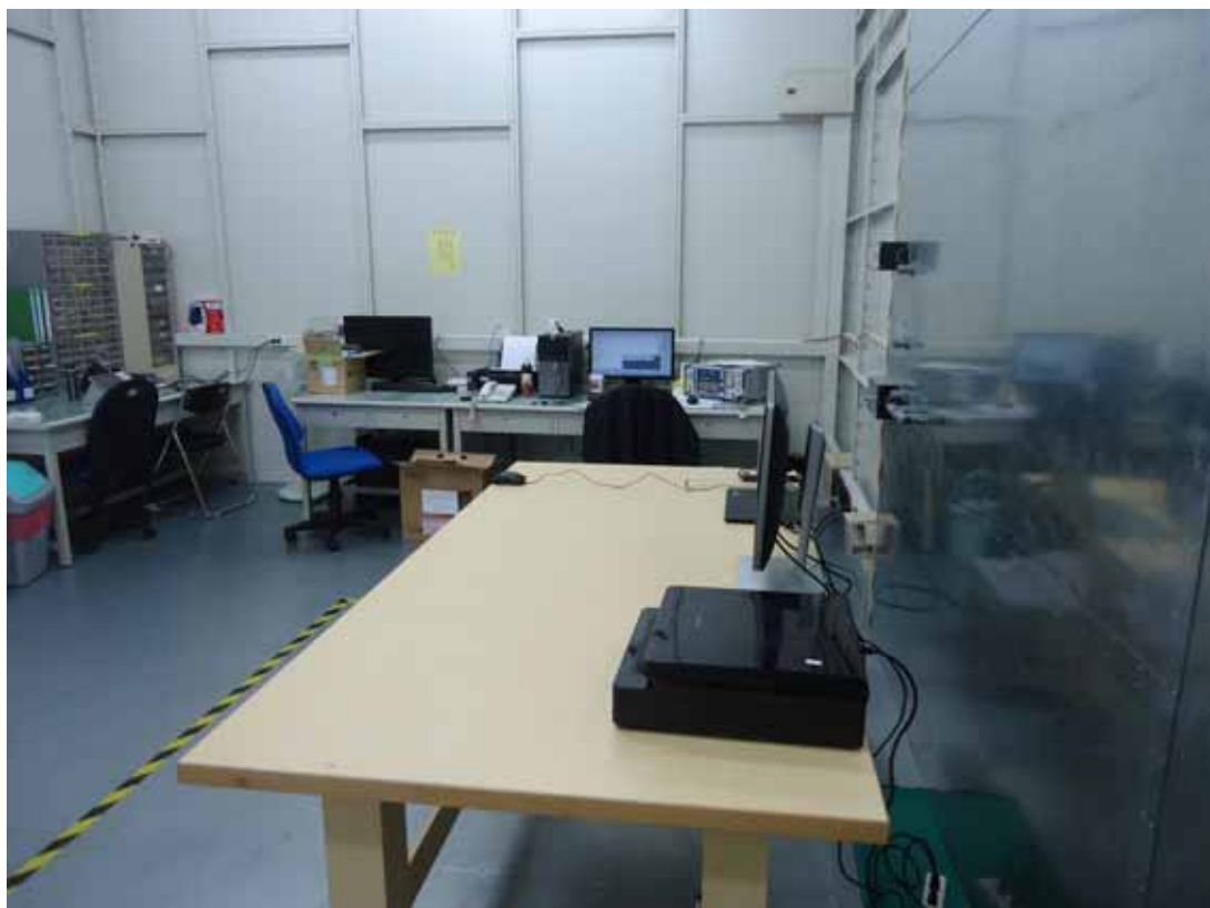
BACK VIEW OF CONDUCTED MEASUREMENT