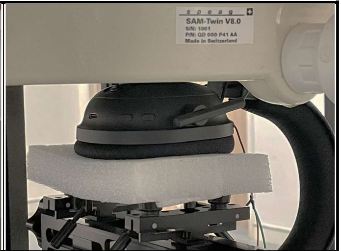
Rear Face of Left Earphone with 0 cm Gap