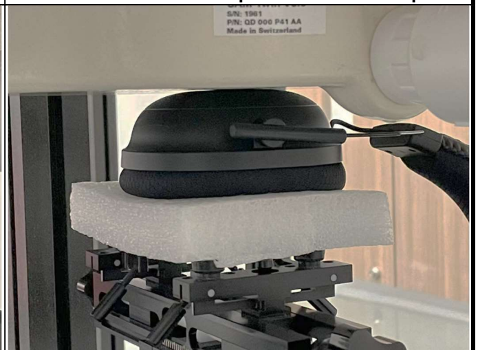
Rear Face of Right Earphone with 0 cm Gap