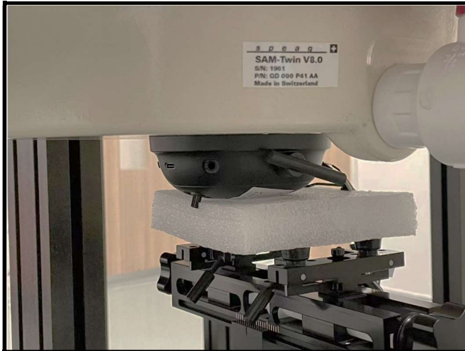
Left of Earphone with 0 cm Gap