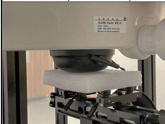
Right of Earphone with 0 cm Gap