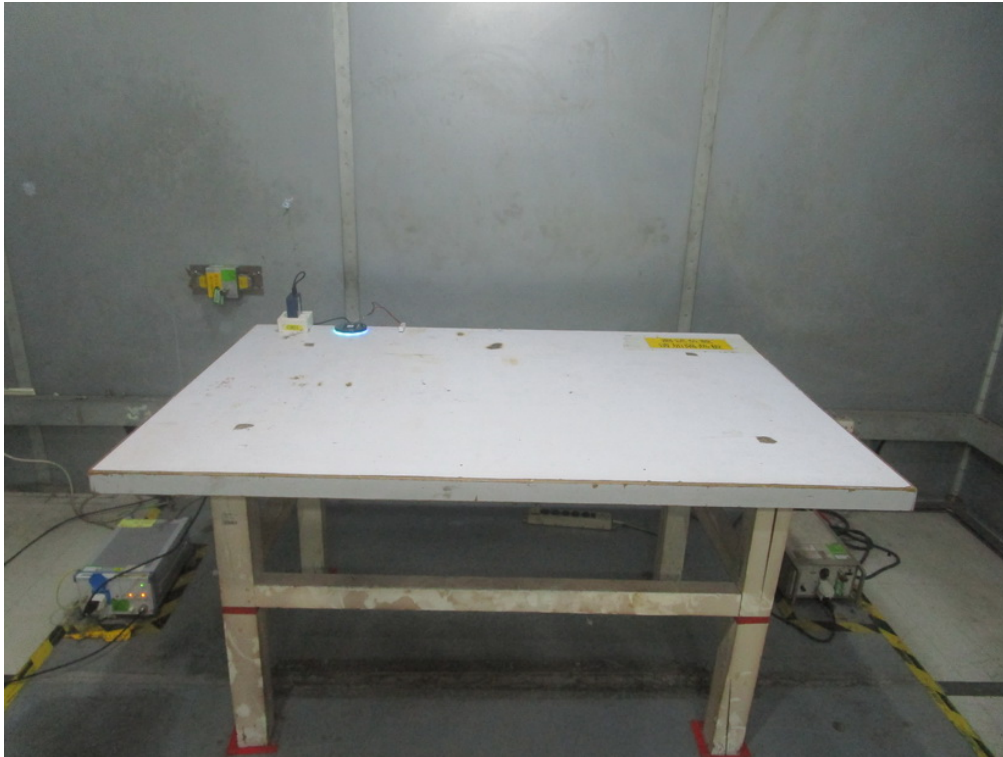
AC Power Line Conducted Emissions