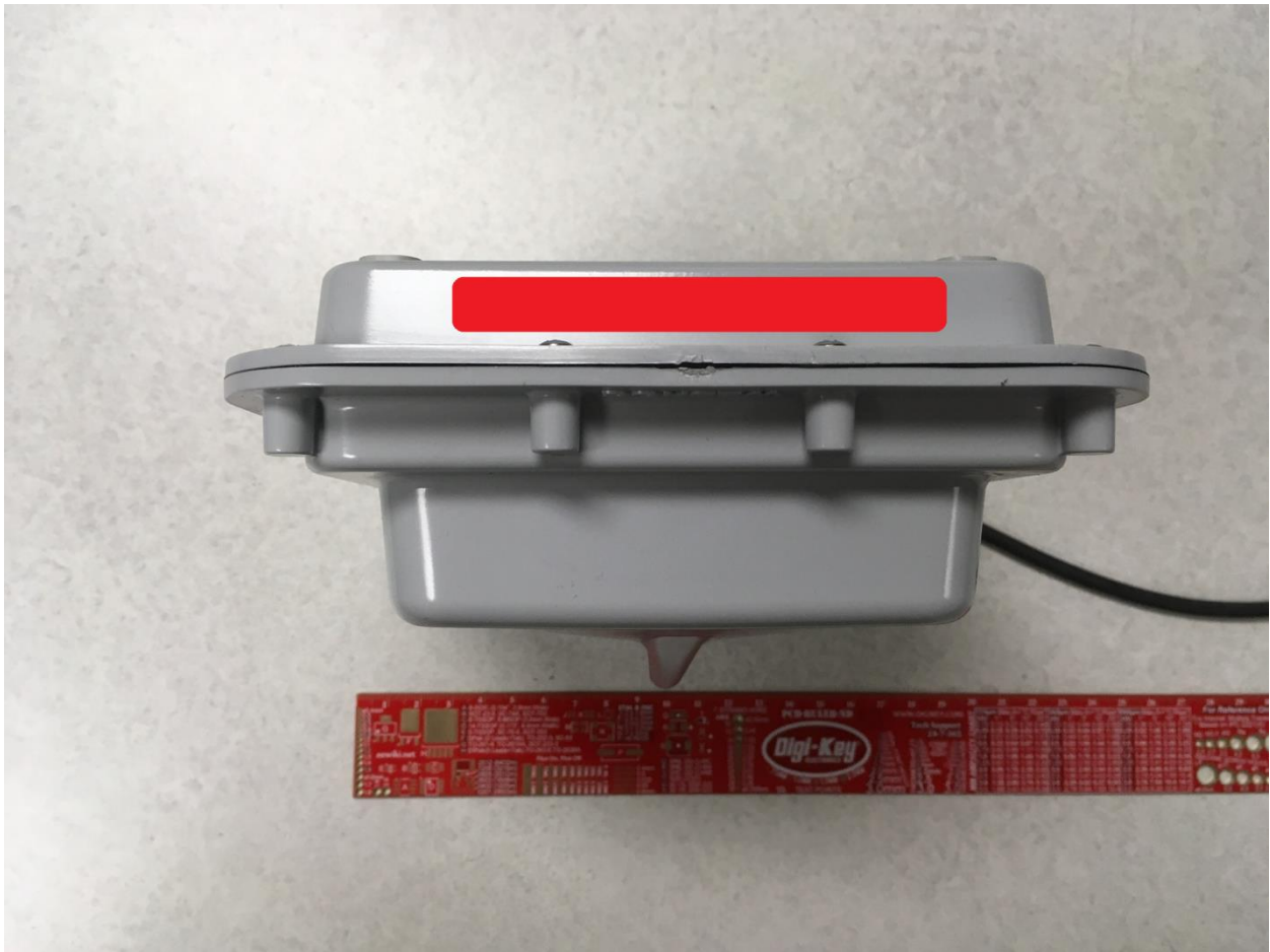
FCC label location shown in red