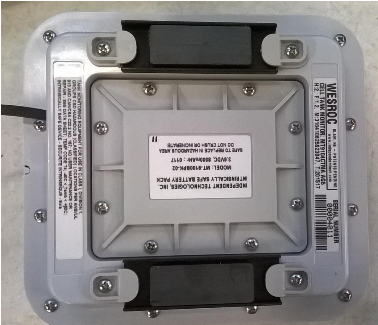
Shows model number/HVIN