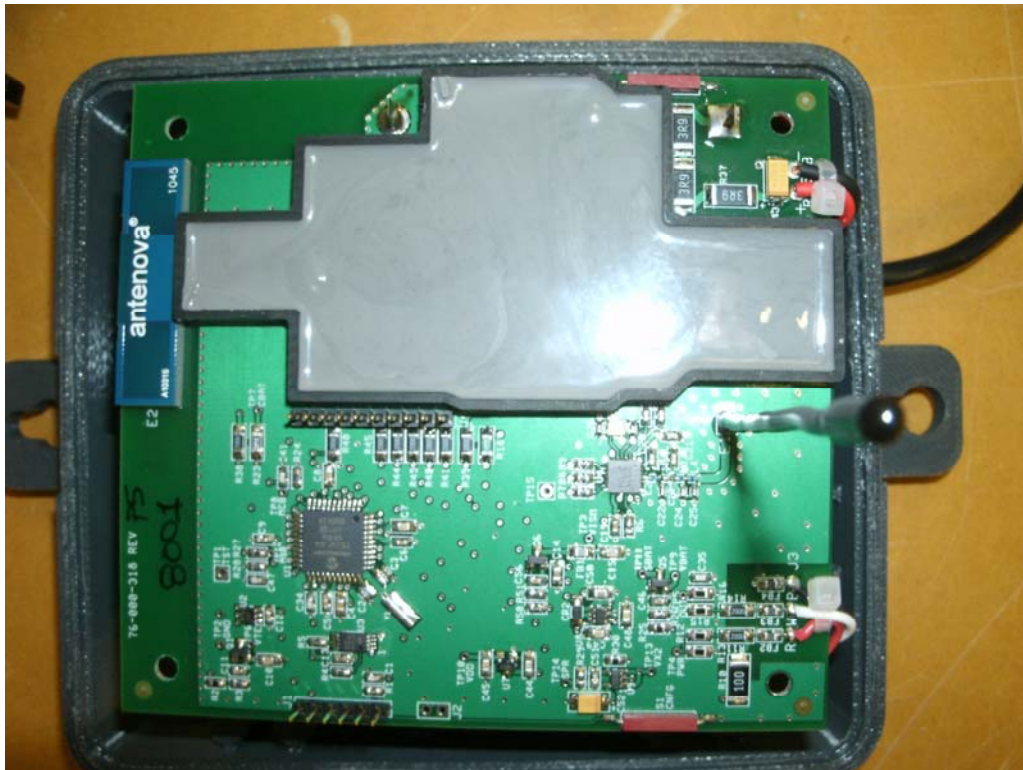
Figure 1 - Internal Photo of circuit board with potting