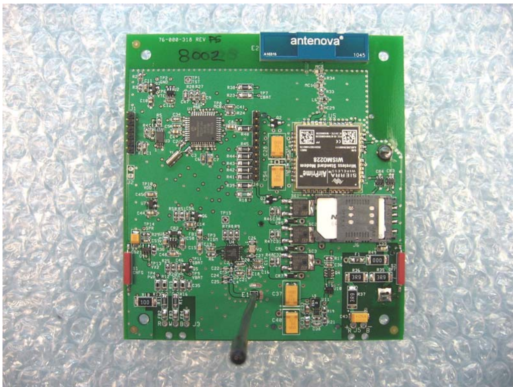
Figure 3 - Internal Photo with Potting Removed