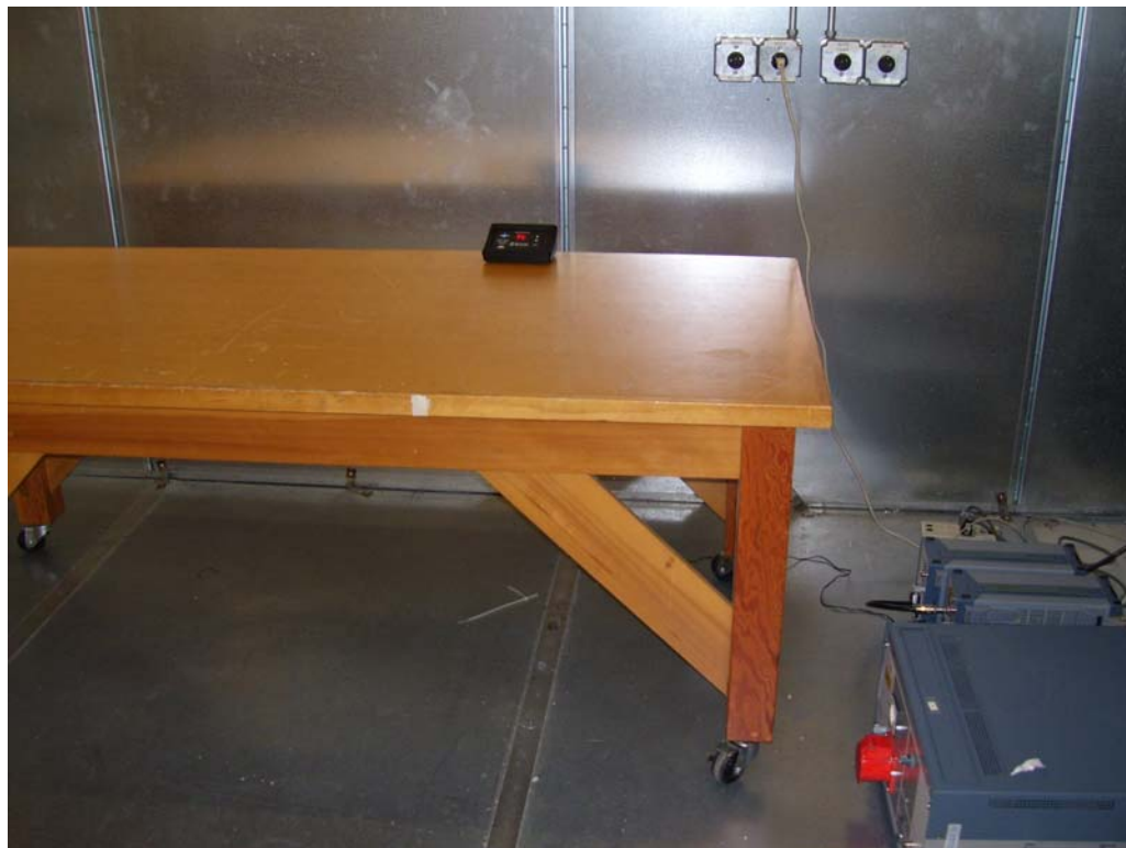
Figure 5 - Conducted Emissions Test Setup