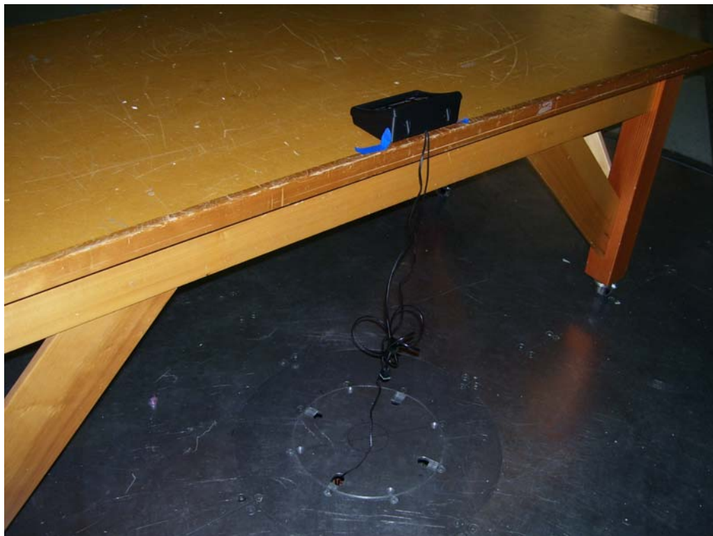
Figure 3 - Radiated Emissions Test Setup