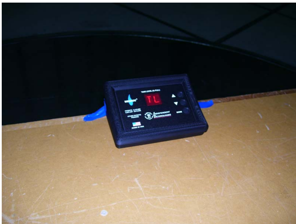
Figure 2 - Radiated Emissions Test Setup