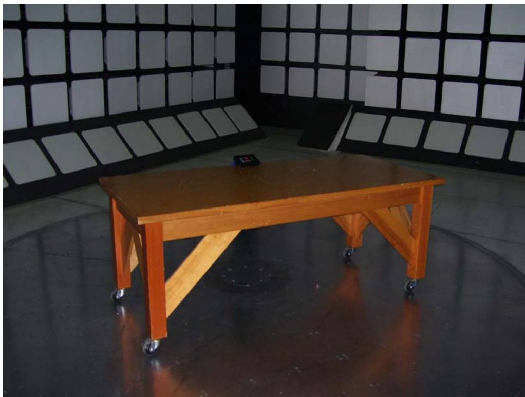
Figure 1 - Radiated Emissions Test Setup