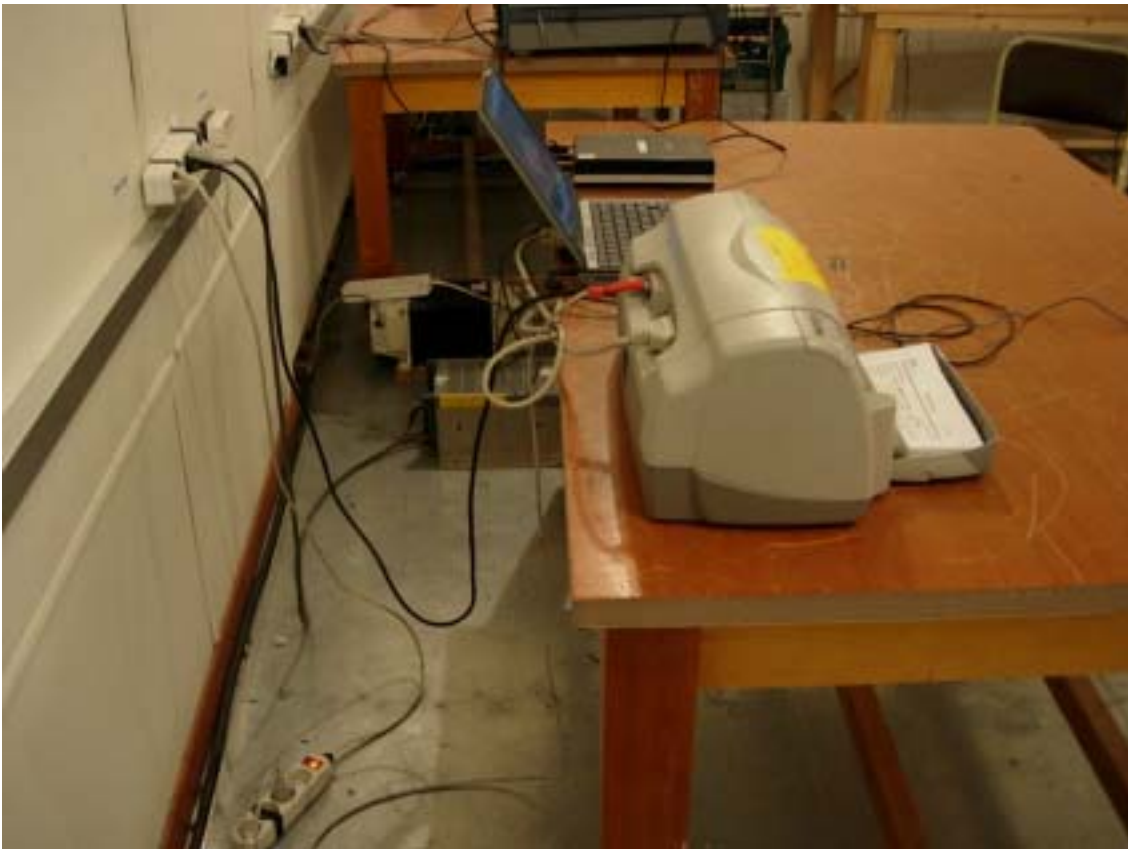
<SIDE PHOTO OF CONTINUOUS DISTURBANCE VOLTAGE >