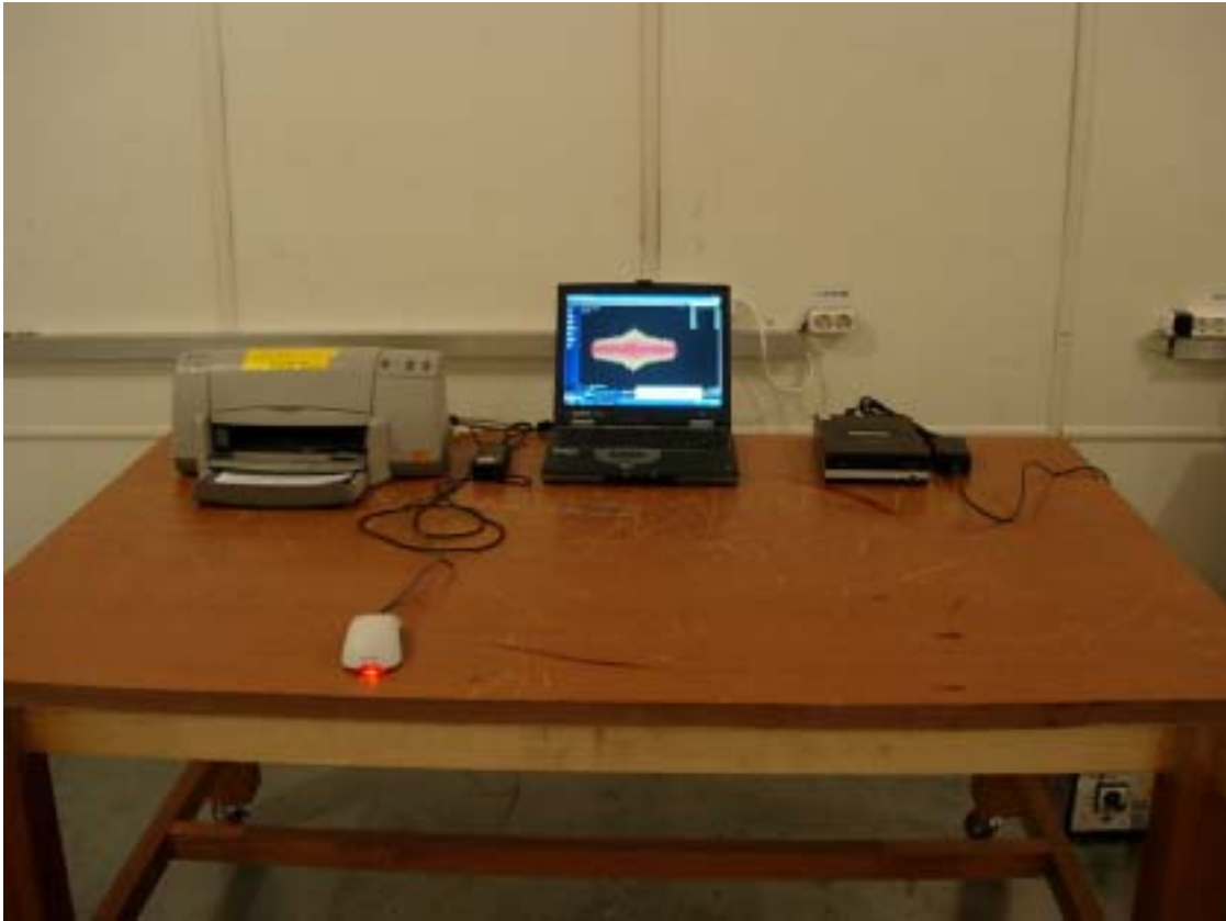
<FRONT PHOTO OF CONTINUOUS DISTURBANCE VOLTAGE >