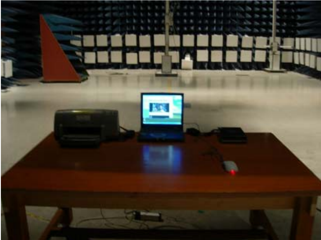
<FRONT PHOTO OF RAIDIATED DISTURBANCE >