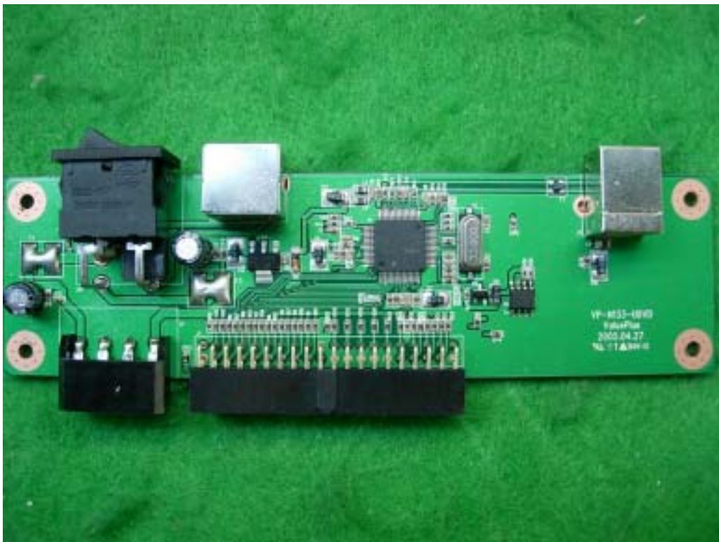
<FRONT SIDE OF MAIN BOARD>