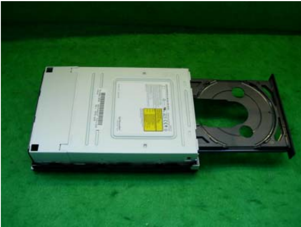
<INNER SIDE OF EUT>