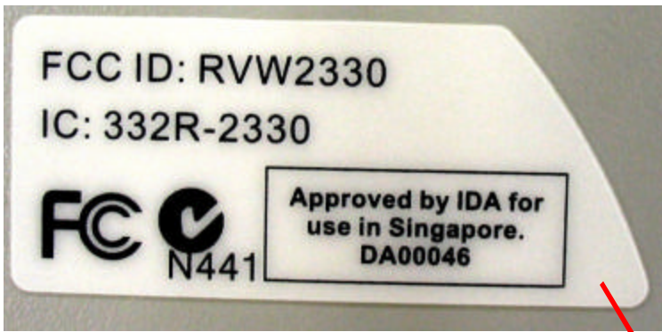
Drawing of Nortel 2330 regulatory label