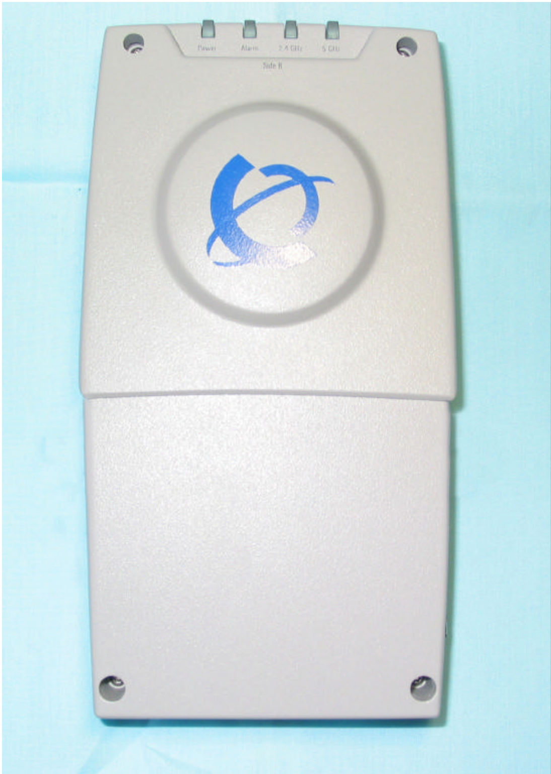
Nortel, INTERNAL antenna version, Side 2