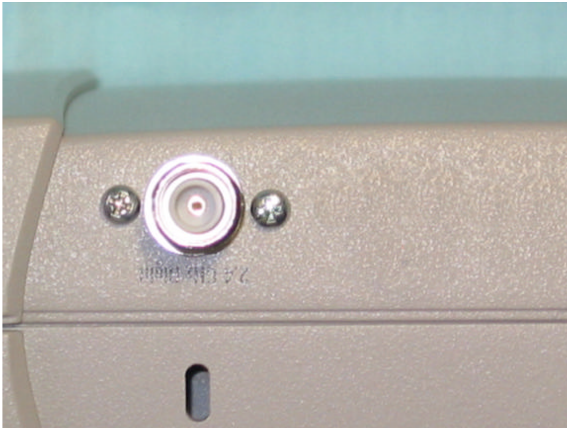
Nortel, BG, EXT, Antenna Connector Detail