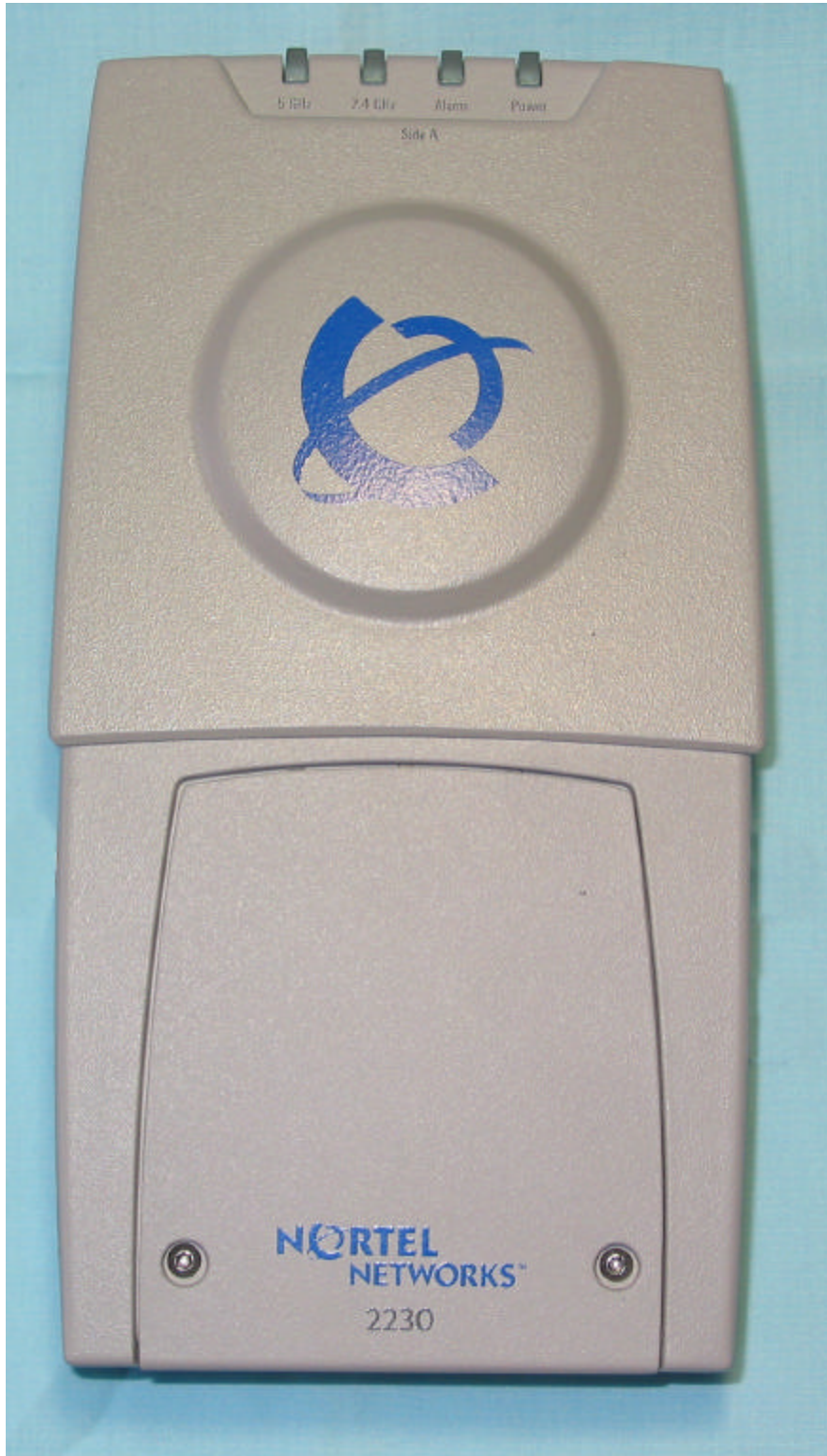
Nortel, INTERNAL antenna version, Side 1