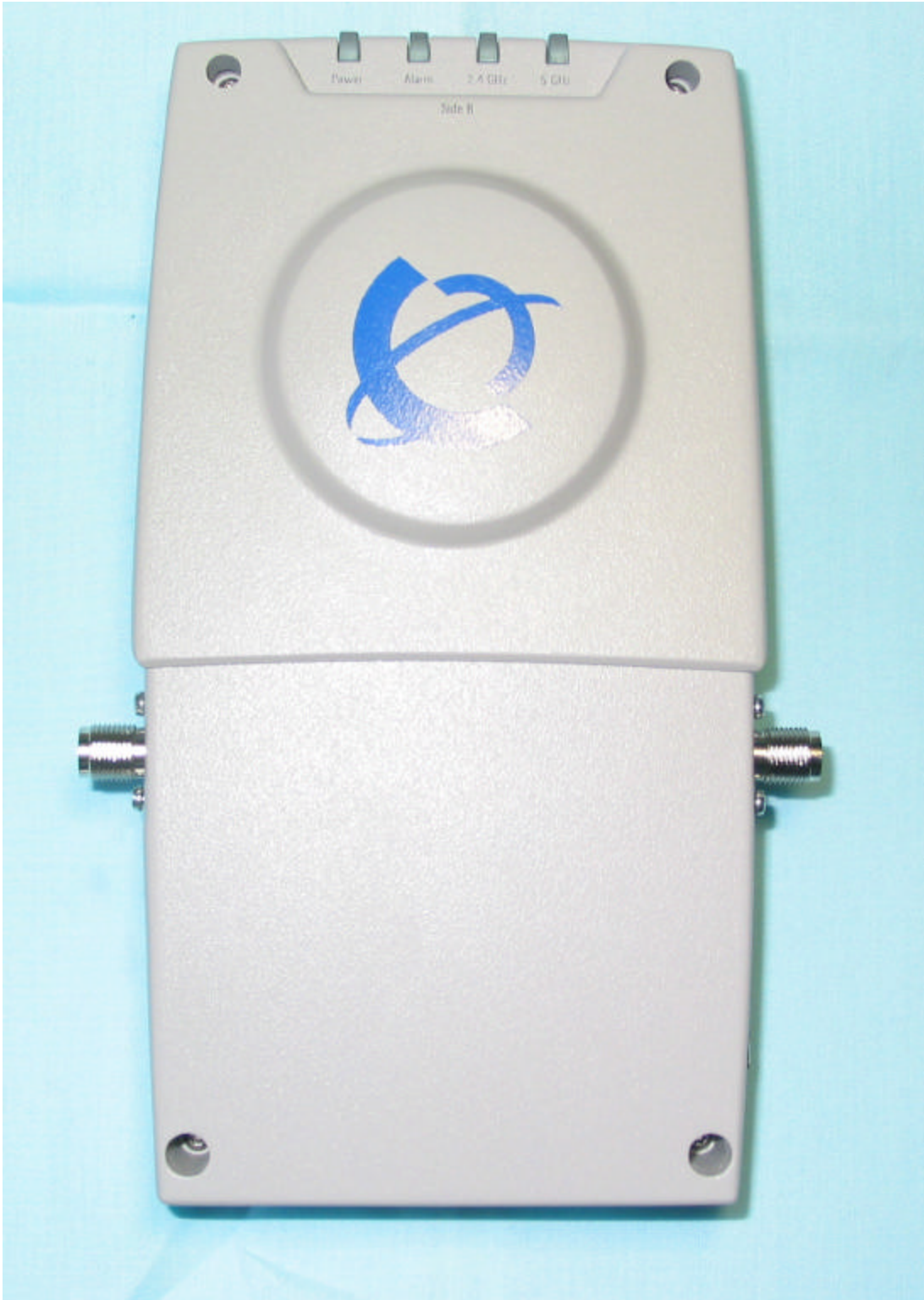
Nortel, BG, EXT, Side 2