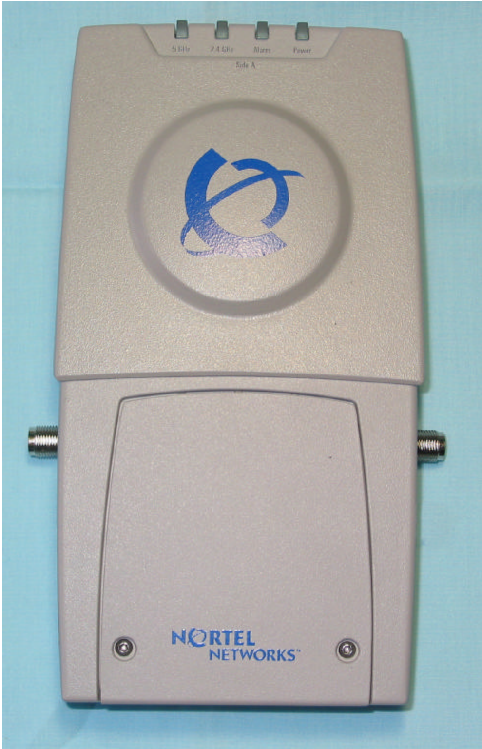
Nortel, BG, EXT, Side 1