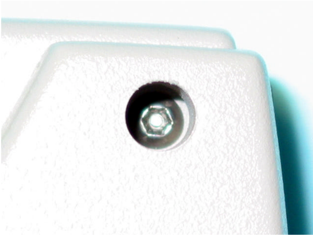
Nortel Networks Access point, Security Screw detail