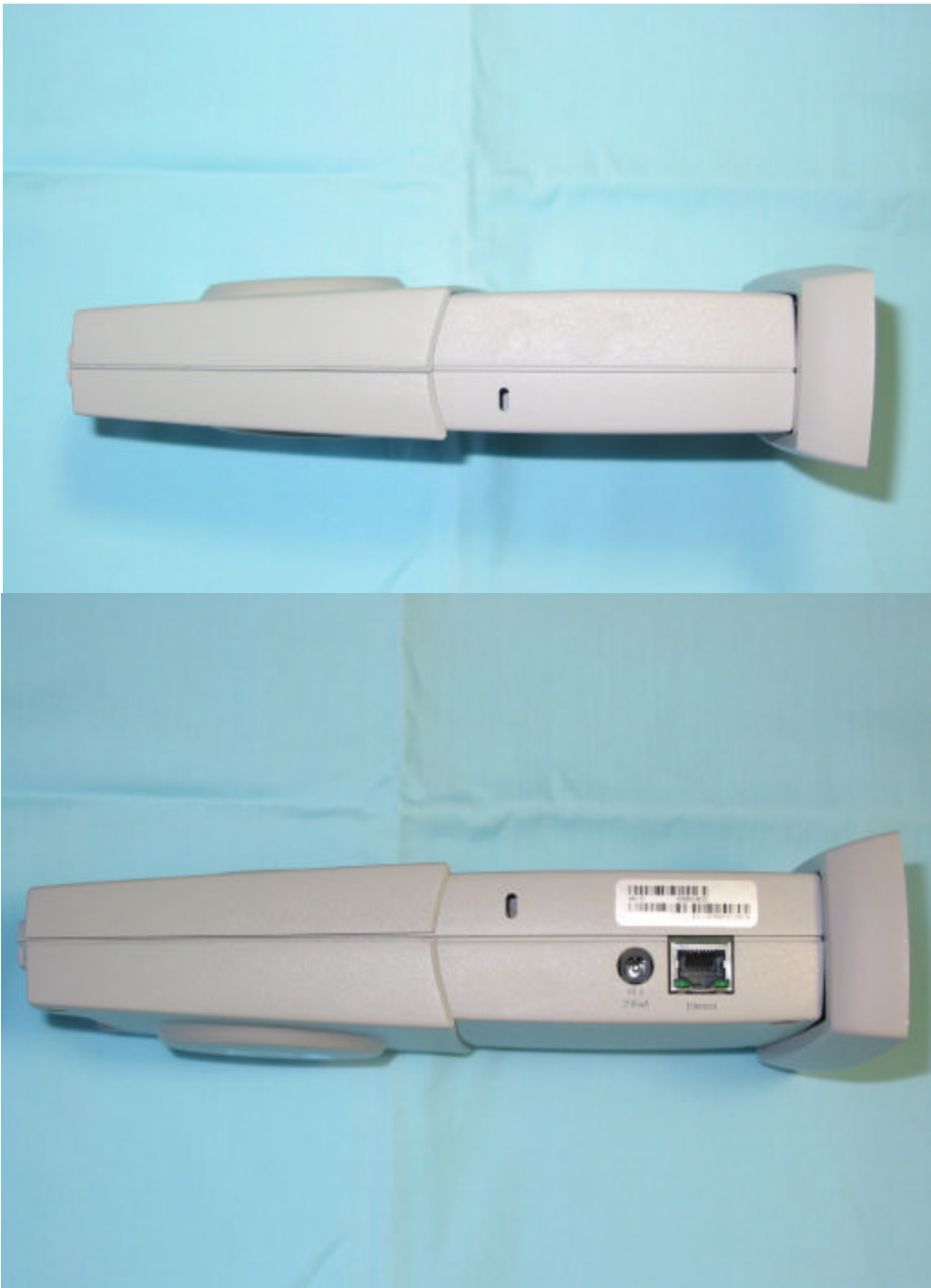
Nortel, INTERNAL antenna version, LEFT and RIGHT sides