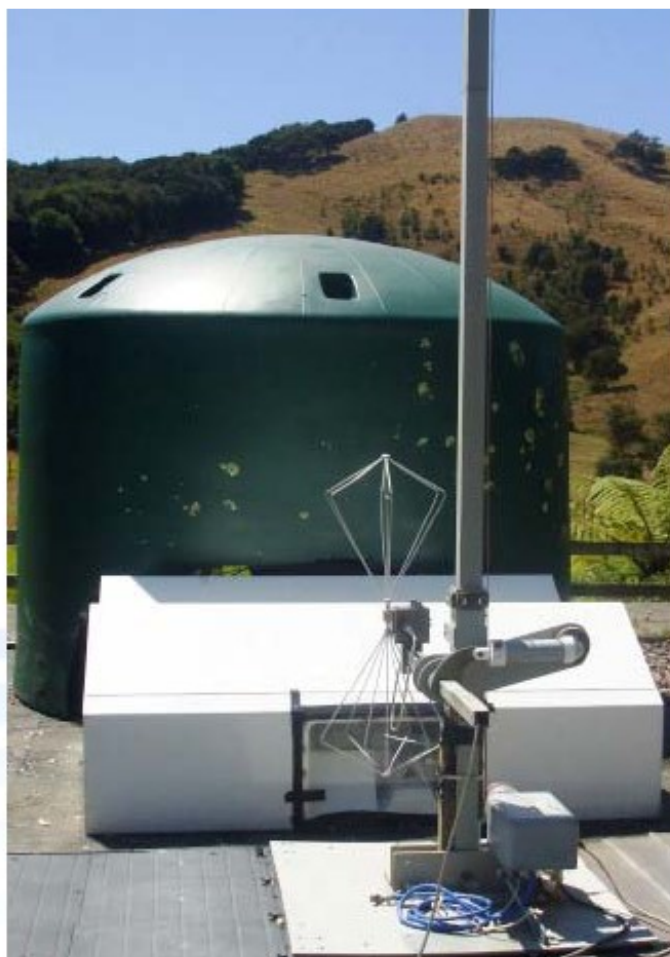
Test Shed showing the use of a Biconical Antenna