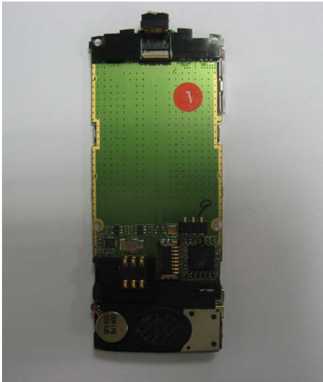
Picture3: the back view of the PCB