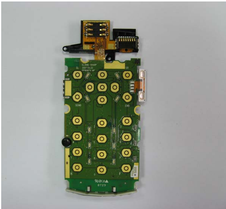
Picture2: Front view of PCB--2