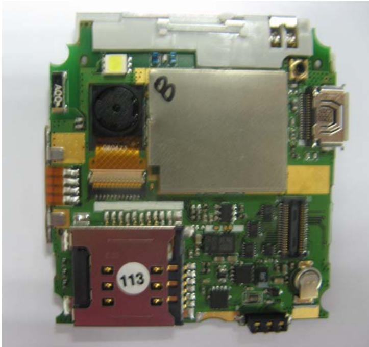
Picture3: the back view of the PCB