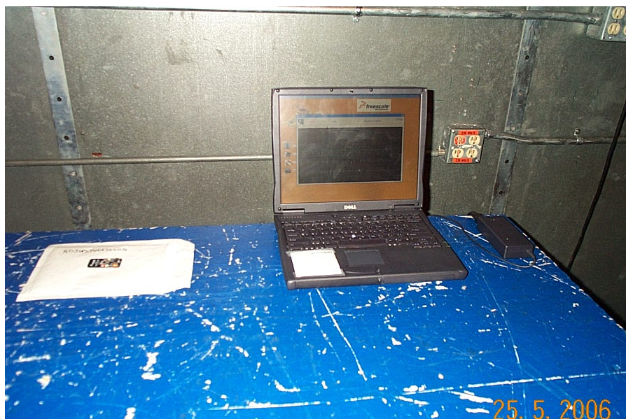
Figure 1, Mains Conducted Emissions - Table

Note – the object to the left on the white envelope is the companion Sensor Board, present to maintain the data link for the EUT at maximum data rate.