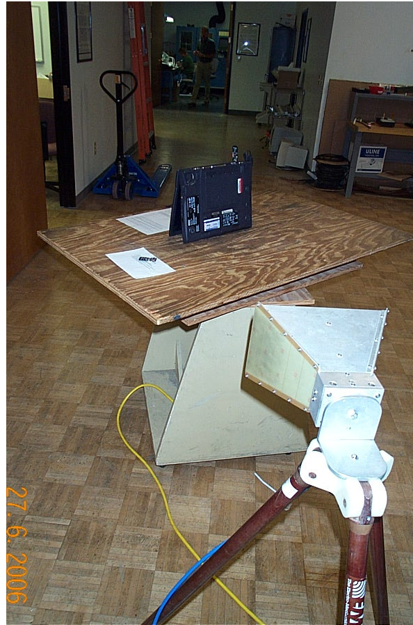
Figure 5, Peak Power, BW, Band Edge, Orientation 3