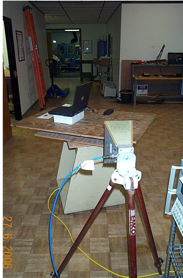
Figure 3, Peak Power, BW, Band Edge, Orientation 1