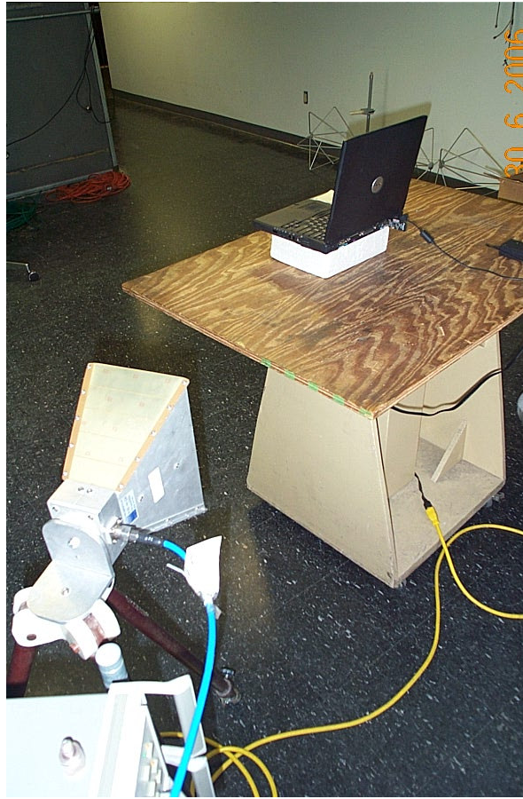
Figure 6, Spurious & Harmonics Radiated > 1 GHz