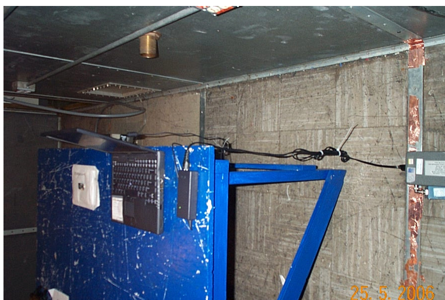
Figure 2, Mains Conducted Emission, Cables

Note – the object to the left on the white envelope is the companion Sensor Board, present to maintain the data link for the EUT at maximum data rate.