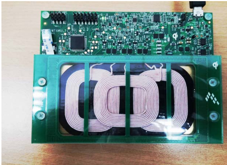
Figure-2 WCT-5WTXMULTI is powered on

Step 1: power on the Transmitter, plug the 5V adaptor to the AC power line, and plug the adaptor USB port to the transmitter input port, and the LED2 will be blanking.