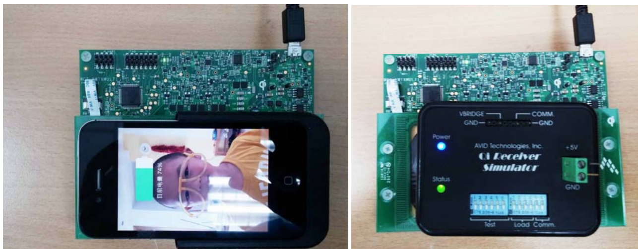
Figure-3 WCT-5WTXMULTI charging the equipments

Step 2: Place the wireless charging RX or some equipment that support the Qi wireless charger(such as cell phone, battery and so on ) on the WCT-5WTXMULTI's coil surface, then the transmitter will charge the equipment, under the normal charging states, LED2 will be turned on all the time, and LED1 will be blanking, and the RX will powered on the equipment normally.