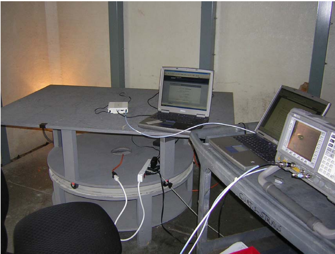
Conducted emissions at the antenna port