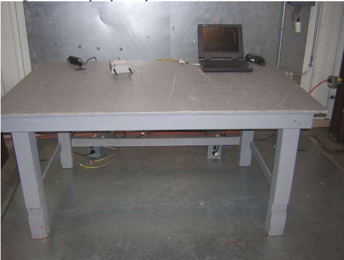
AC mains conducted emissions