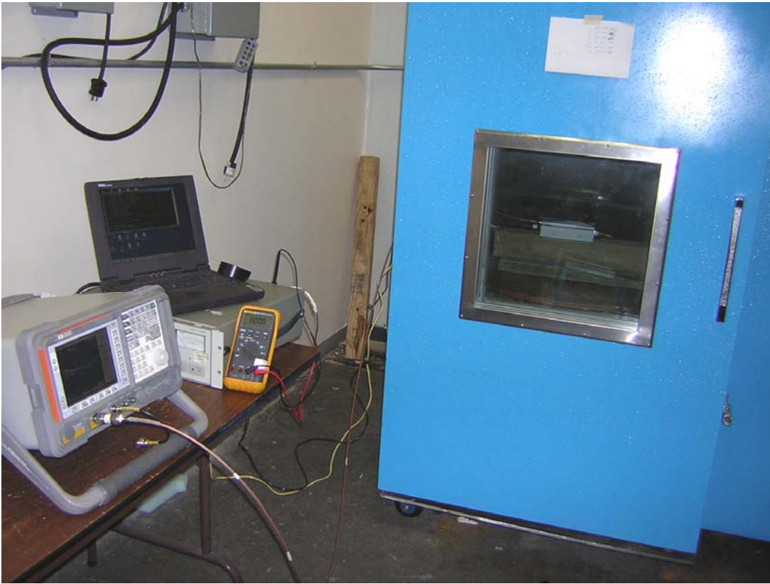
Voltage variation/Frequency stability