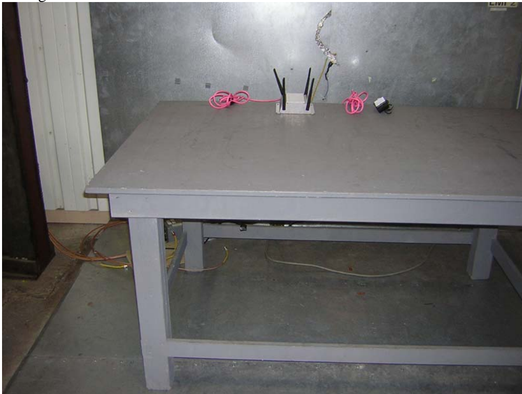
AC conducted Emissions