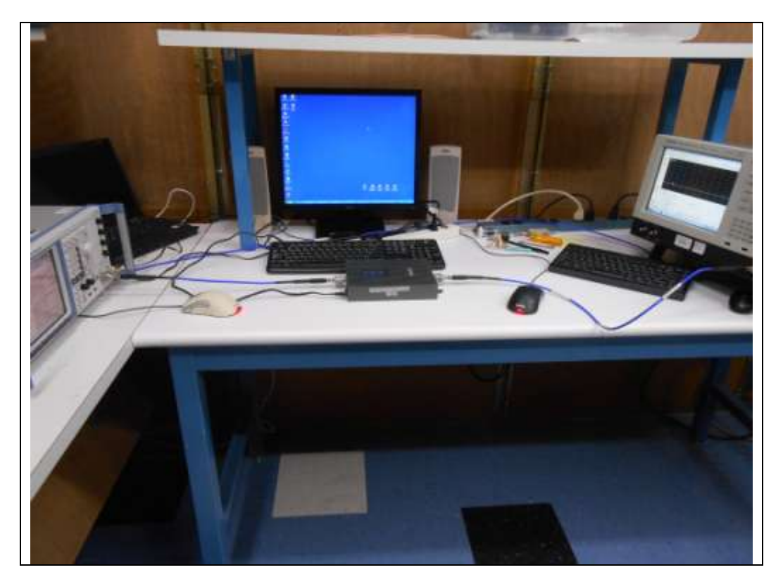
RF Conducted #2