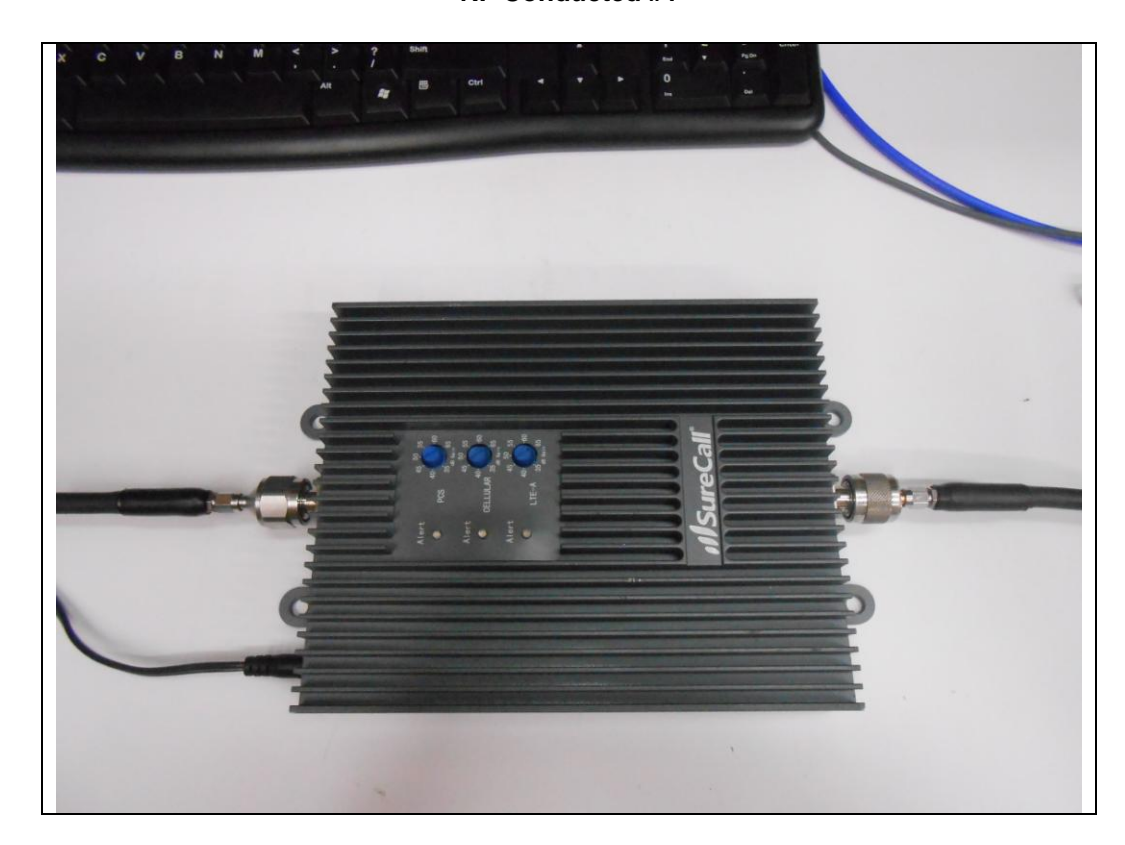
RF Conducted #2