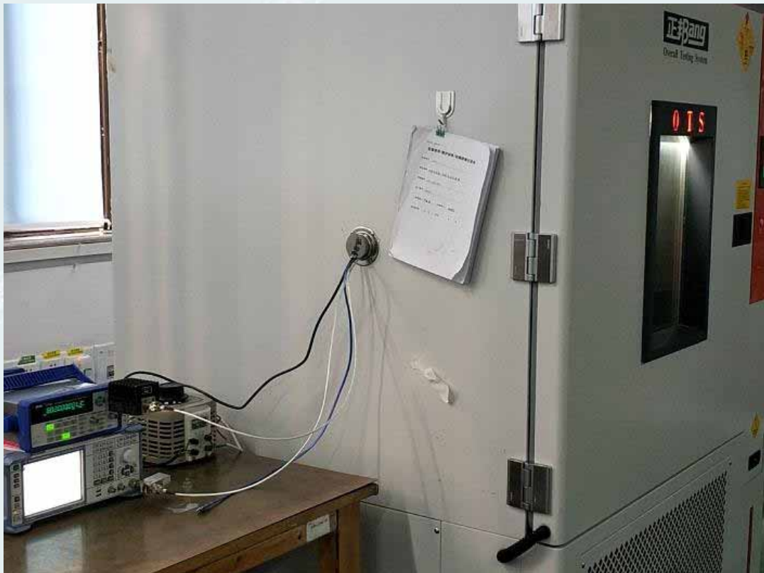
Temperature change test-1