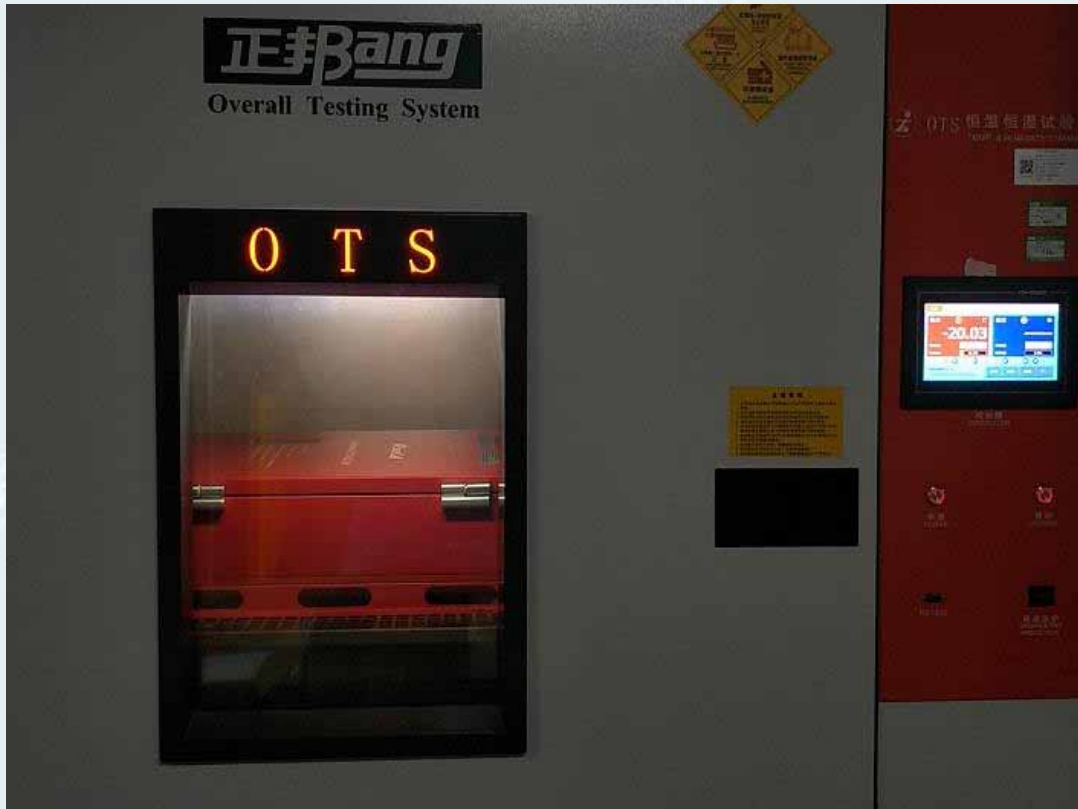
Temperature change test-1