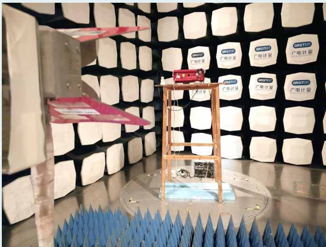
Radiated spurious emissions—Above 1GHz