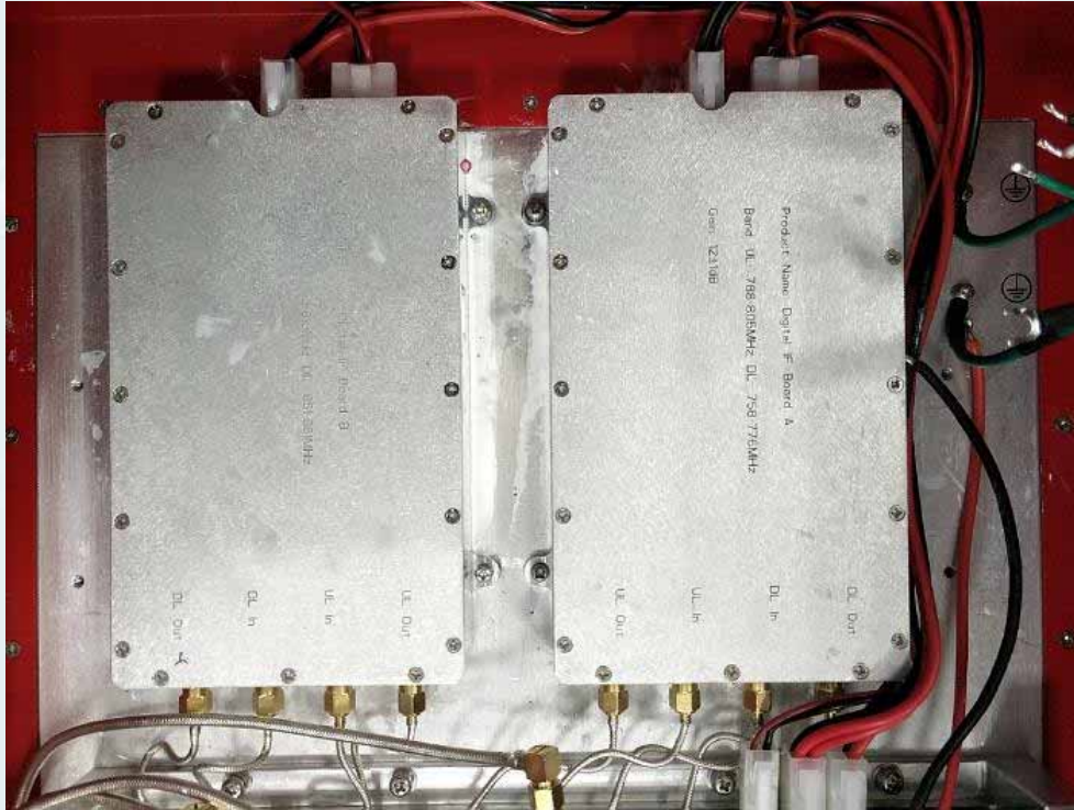
DIF A and DIF B