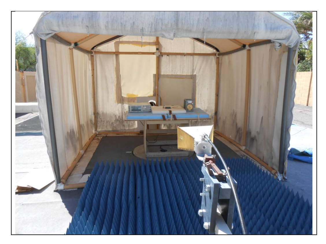
RF Radiated #2