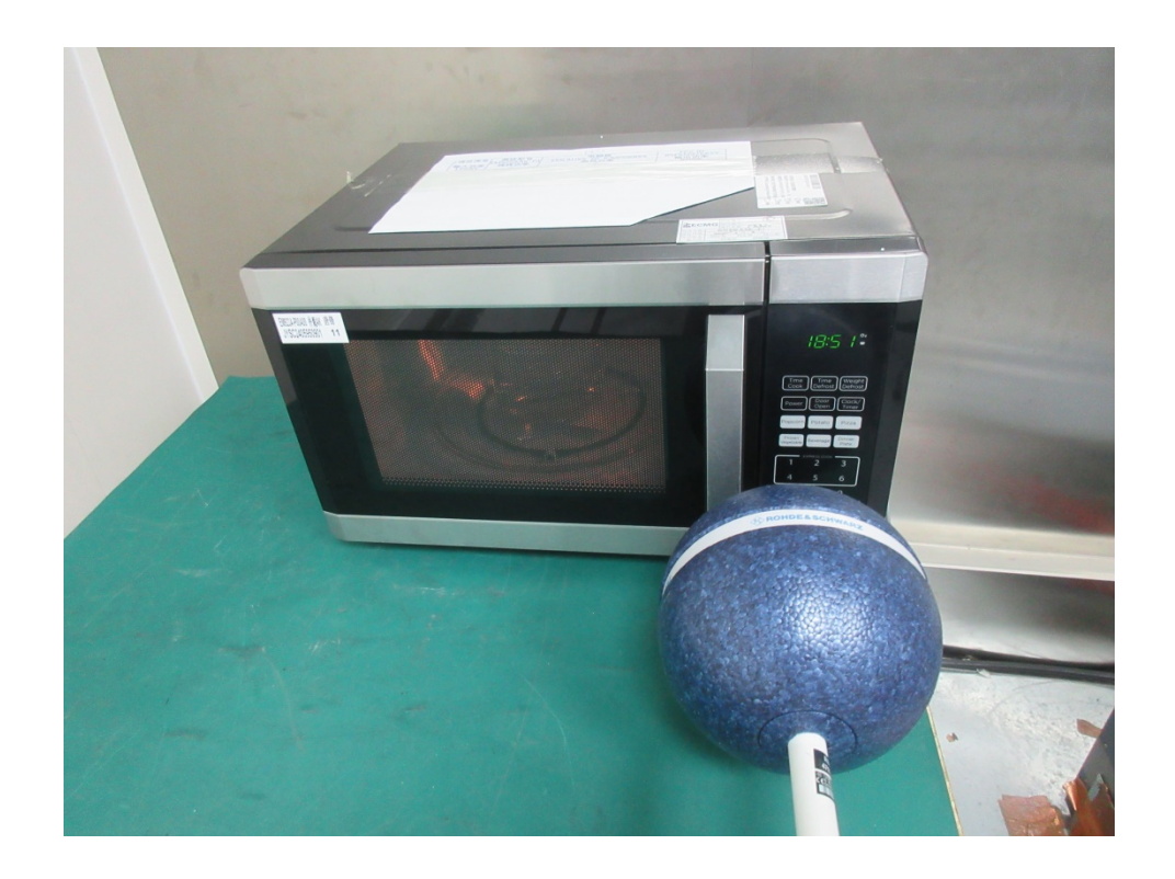
End of the report