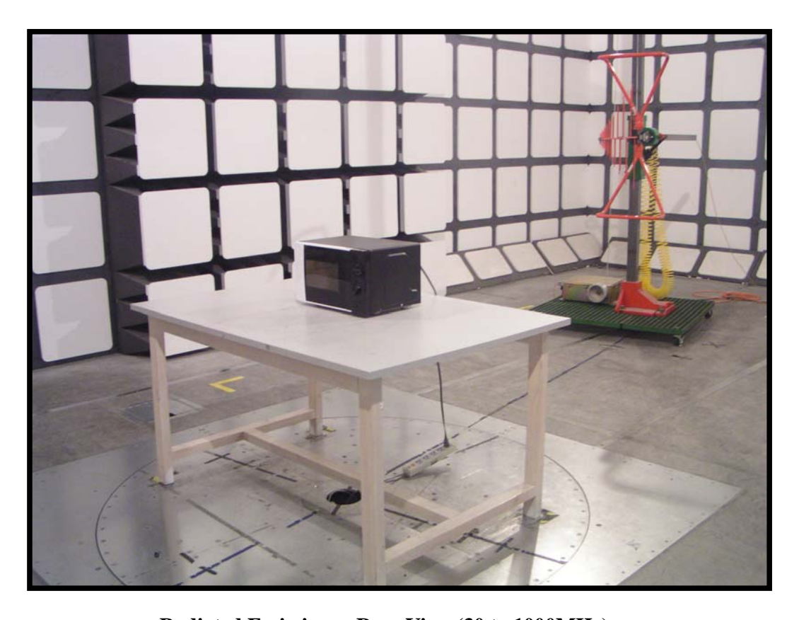
Radiated Emissions - Rear View (30 to 1000MHz)